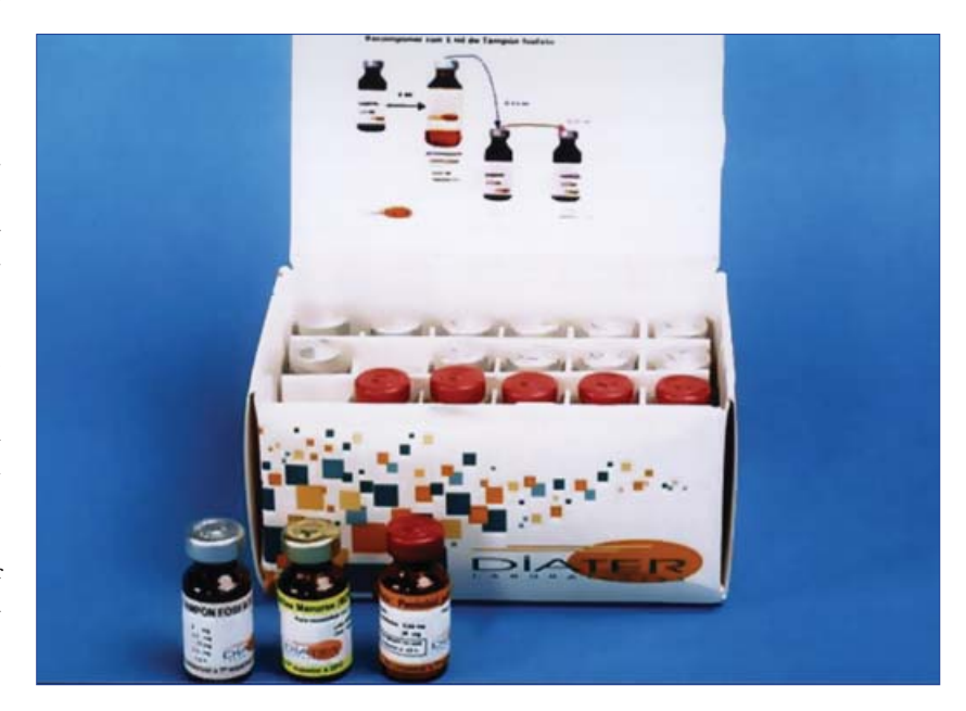
Figure 2: PPL and MDM reactivity in skin tests is reported more often in patients with immediate reactions compared to those with delayed reactions.

taining penicillin G, penicillin V, amoxicillin and ampicillin and with appropriate history suspected cephalosporins applied according to the recommendations for patch testing [13, 15]. Interpretation was done according to the guidelines of the German Contact Dermatitis Research Group,